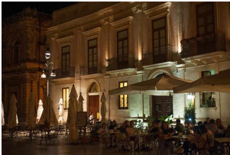
Ortigia at night