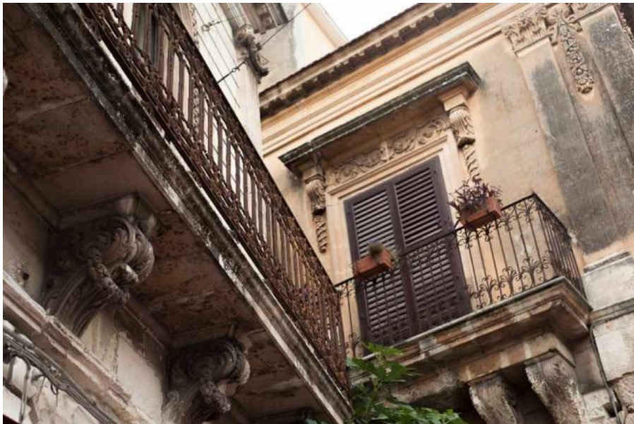
Baroque architecture in Modica

Bar Caffè Blasè, Viale Paolo Calleri, Marzamemi, Italy