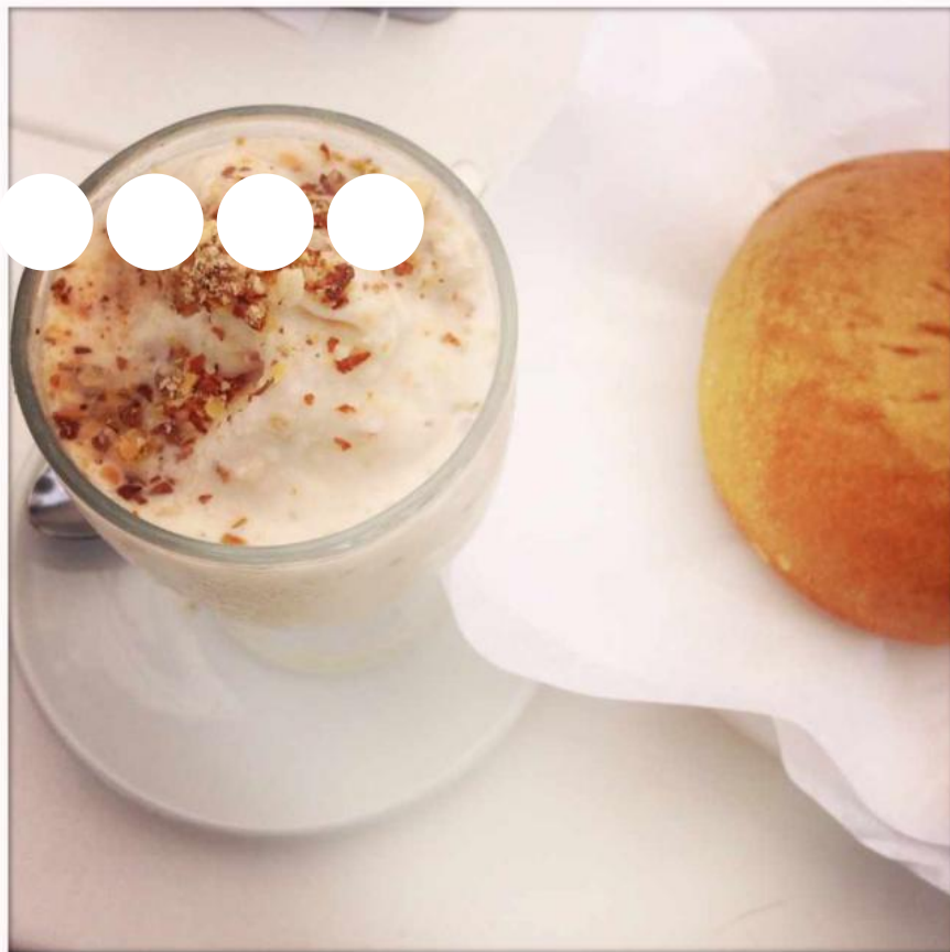
Sicilian Granita and brioche