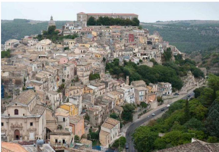
Panoramic view of Ragusa Ibla